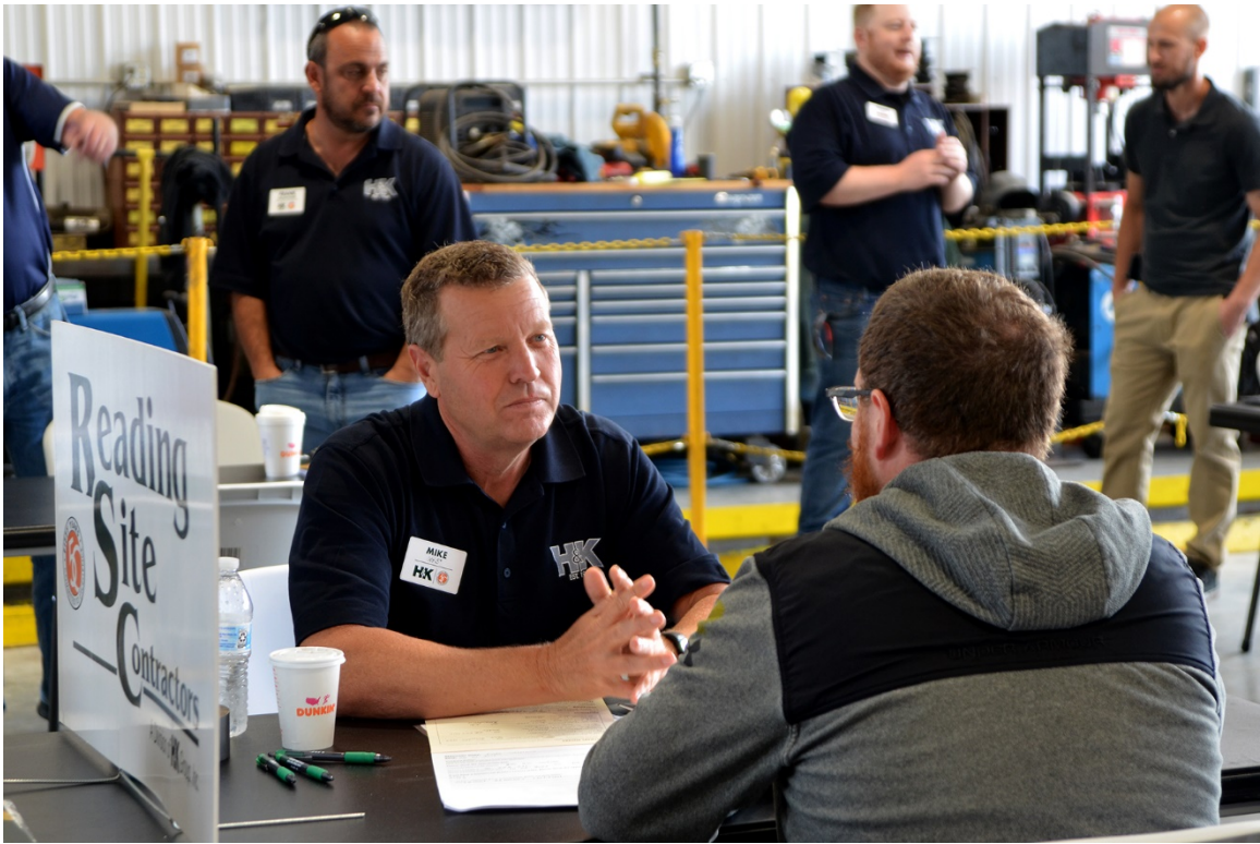
An H&K representative interviews a prospective employee.