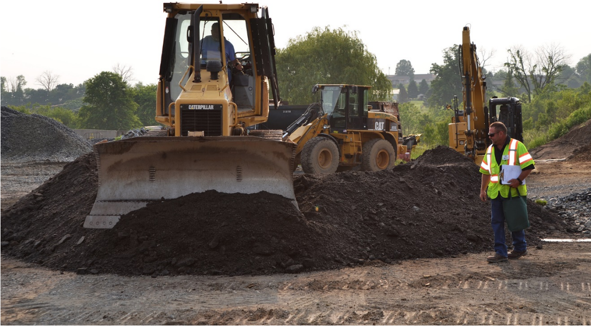
A heavy equipment operator candidate taking instruction from a skilled H&K Heavy Equipment Operator and Job Fair Testing Instructor during a skill testing session on June 1 st .