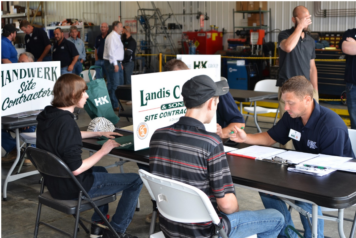
Two prospective employment candidates complete their initial interviews.